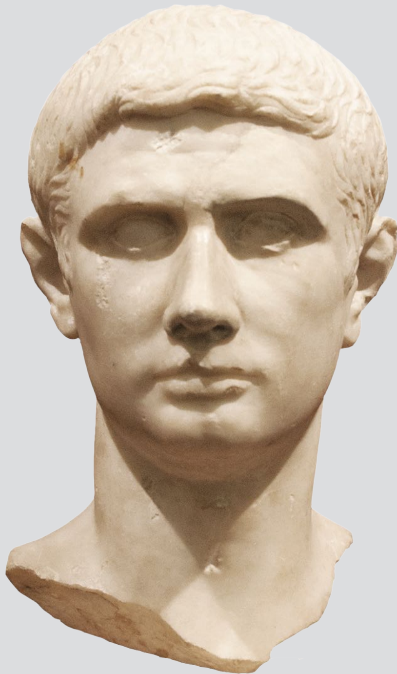
Marcus Junius Brutus